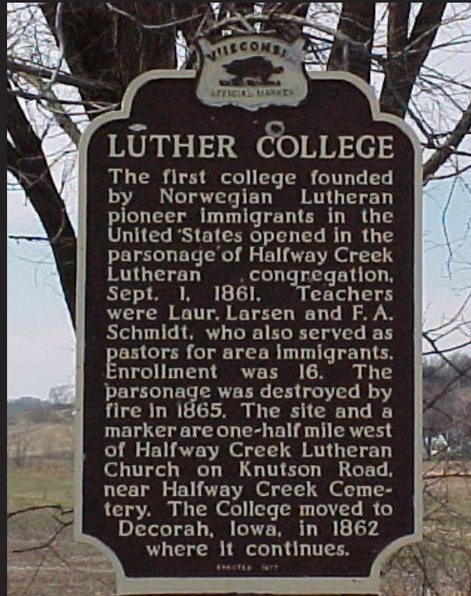
LUTHER COLLEGE DECORAH, IOWA