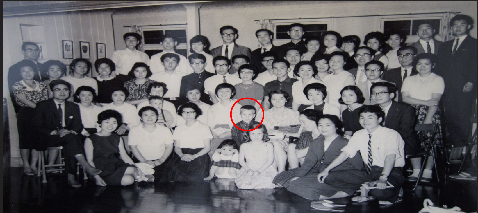
30TH ANNUAL HUNTER HOTEL CONFERENCE | GEORGIA STATE UNIVERSITY